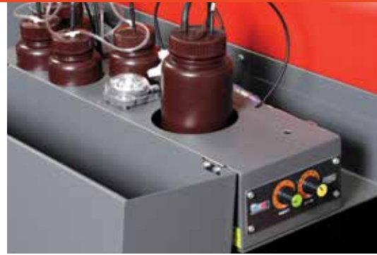
Bulk ink system with WIMS® ink circulation and filtration.

The Compress iUV industrial print head features 1440 nozzles capable of delivering a minimum picolitre drop of just 3.5Ng for ultra fine dot placement. When configured with up to 6 colors of CMYK – White and Clear, our 1150mm wide print width delivers 1440 dpi native print resolutions at incredible speed with remarkable color brilliance.