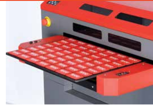
iUV-350s - Print area A3+[604x350] iUV-600s - Print area A2+ [604x450] iUV-1200s - Print area A0- [1150x750mm]

Bringing print production in-house, the time saved on logistics and handling allows for significant cost savings and faster reaction to changing market needs.